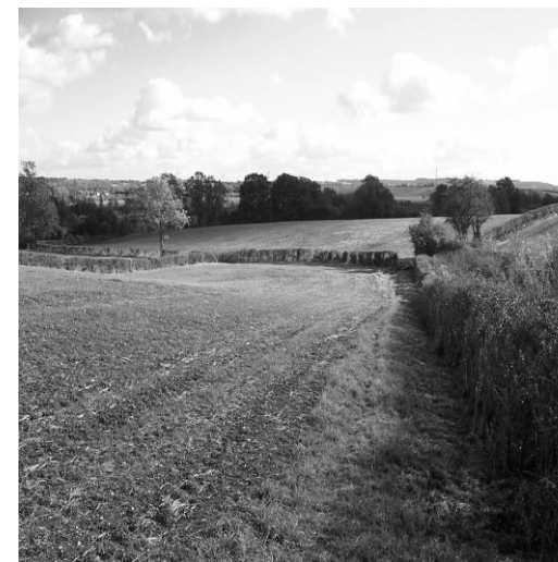
View looking back from Crowbush

Most fields are used for grazing, so there is always livestock in some fields along the route where dogs need to be kept under close control. The route is stile free, but has seven kissing gates and three staggers. In good weather with firm ground allow about an hour for the walk.