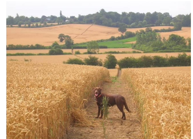
View of path back towards Toddington

Farm livestock may be in some of the fields you cross, so dogs must be kept under close control. There are six kissing gates and a handful of steps to climb. The many arable fields may be muddy in places, particularly after ploughing. Much of the walk is over land managed by Heathcote Farm Ltd who request you support their environmental work by respecting the county code.