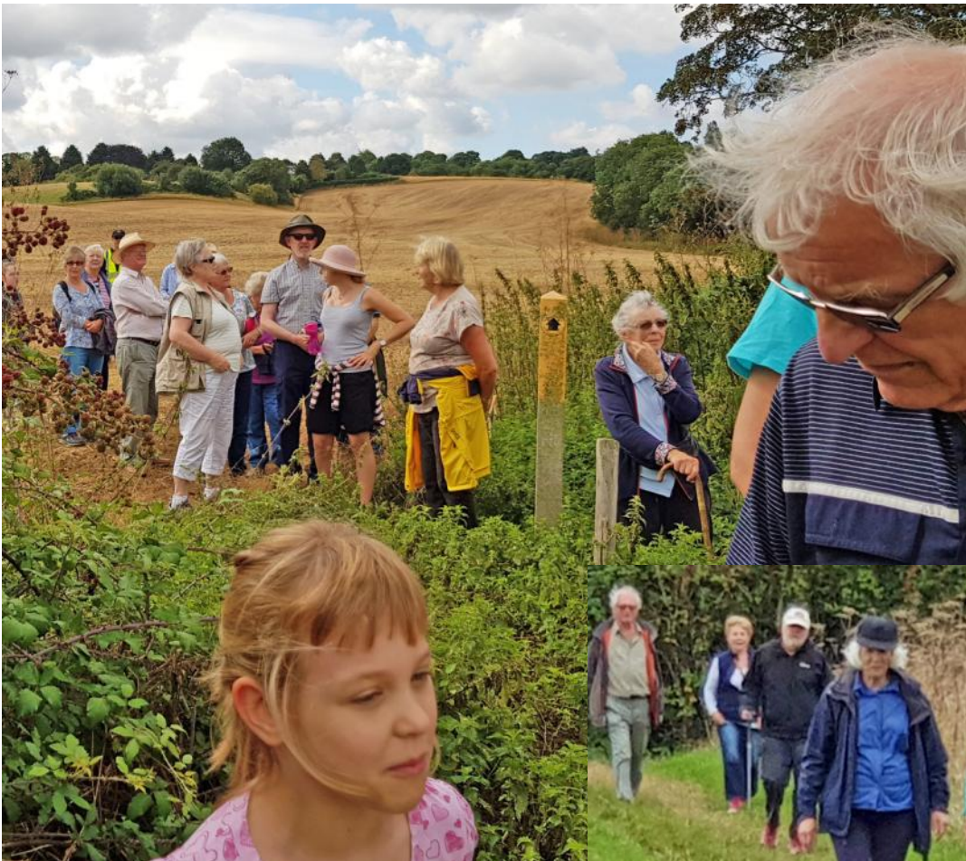
Good to have escorted grandchildren in school holidays. On the Graffiti Walk