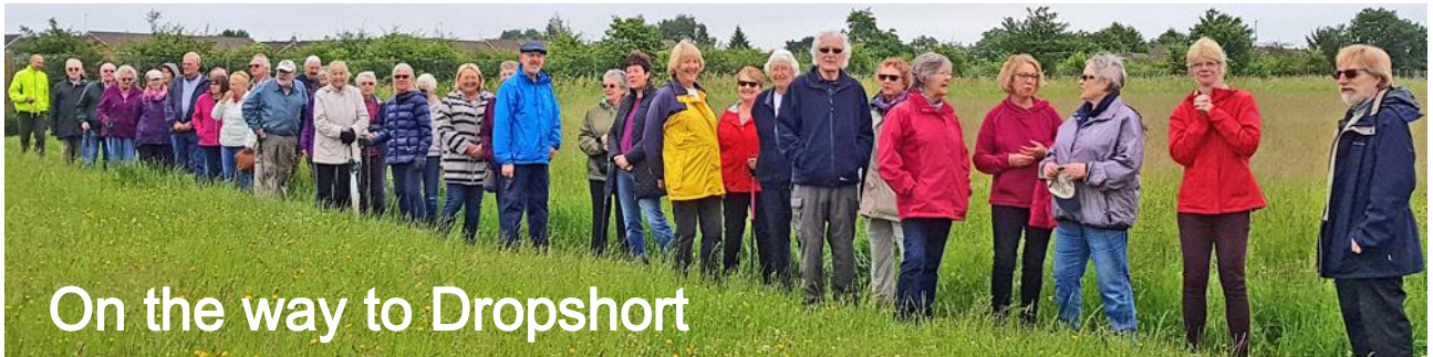
On the way to Dropshort