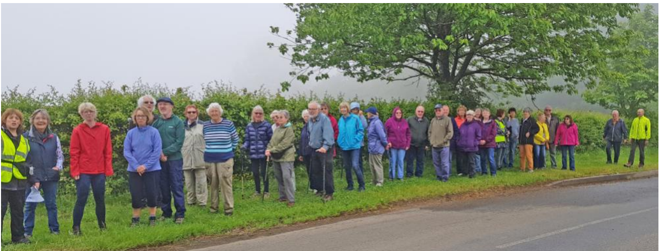
Thirty-six in the mist

We go through folk 's property quite a few times: Park House, Chalgrave Manor and Mill Farm all have footpaths going through their land.