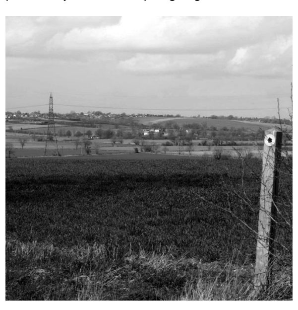
View towards Toddington from the Bound Way

Farm livestock may be in grazing fields so dogs must be kept under control. There is one stile to climb and fourteen gates. Arable fields may be muddy in places, particularly after recent ploughing.