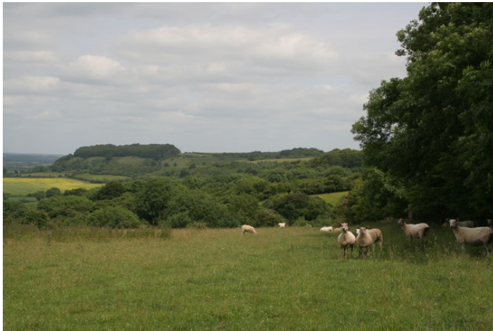
View towards Sharpenhoe Clappers with sheep grazing from waypoint [4]