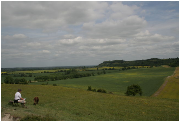
View from Sundon Hills [3] towards Sharpenhoe Clappers.