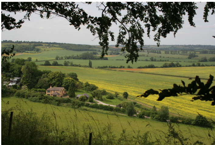
View towards Sundon Hills from Sharpenhoe Clappers [1]