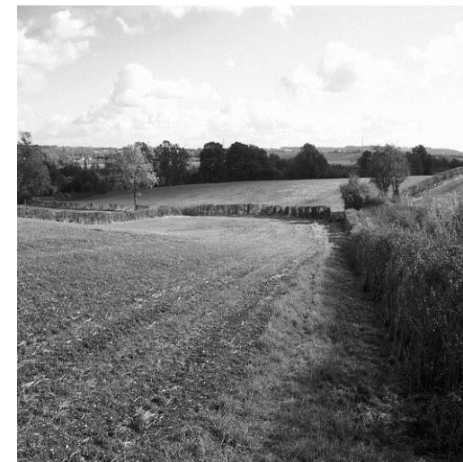
View looking back from Crowbush

Most fields are used for grazing, so there is always livestock in some fields along the route - dogs need to be kept under close control. The route is stile free, but has seven kissing gates and three staggers. In good weather with firm ground allow about an hour for the walk.